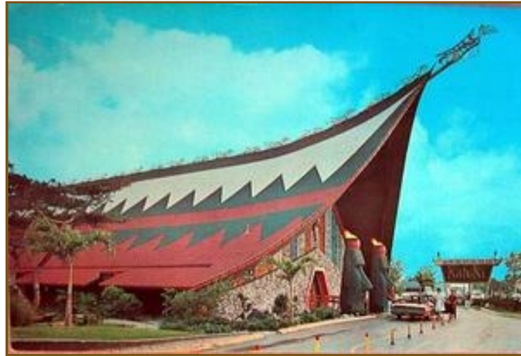
Postcard from Kahiki Supper Club in Columbus circa 1965, from the collection of Swanky